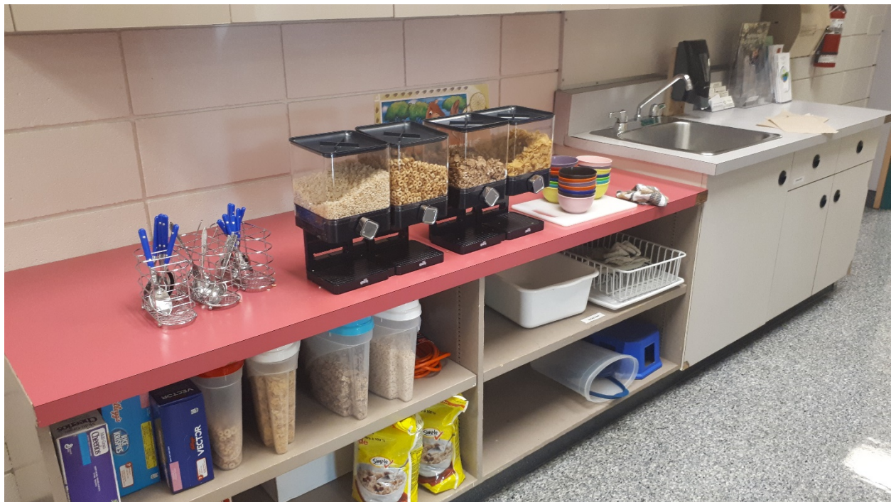
Cereal Options for Breakfast Program